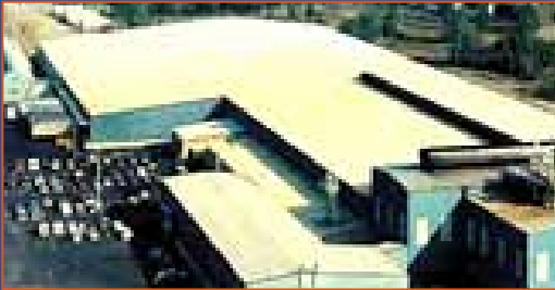
Flat River, Missouri, USA