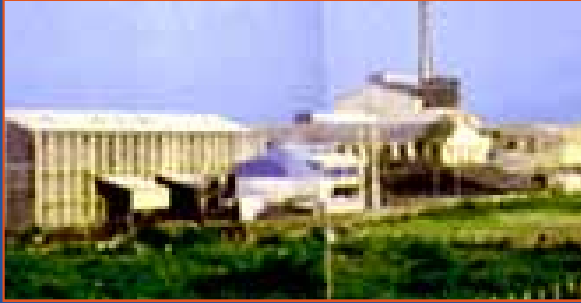
Kosamba, Gujarat, India