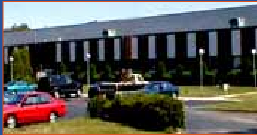
Williamstown New Jersey, USA