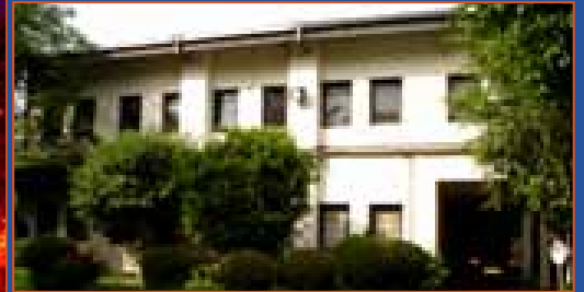
Horana, Sri Lanka