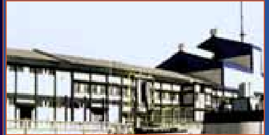
Jambusar, Gujarat, India